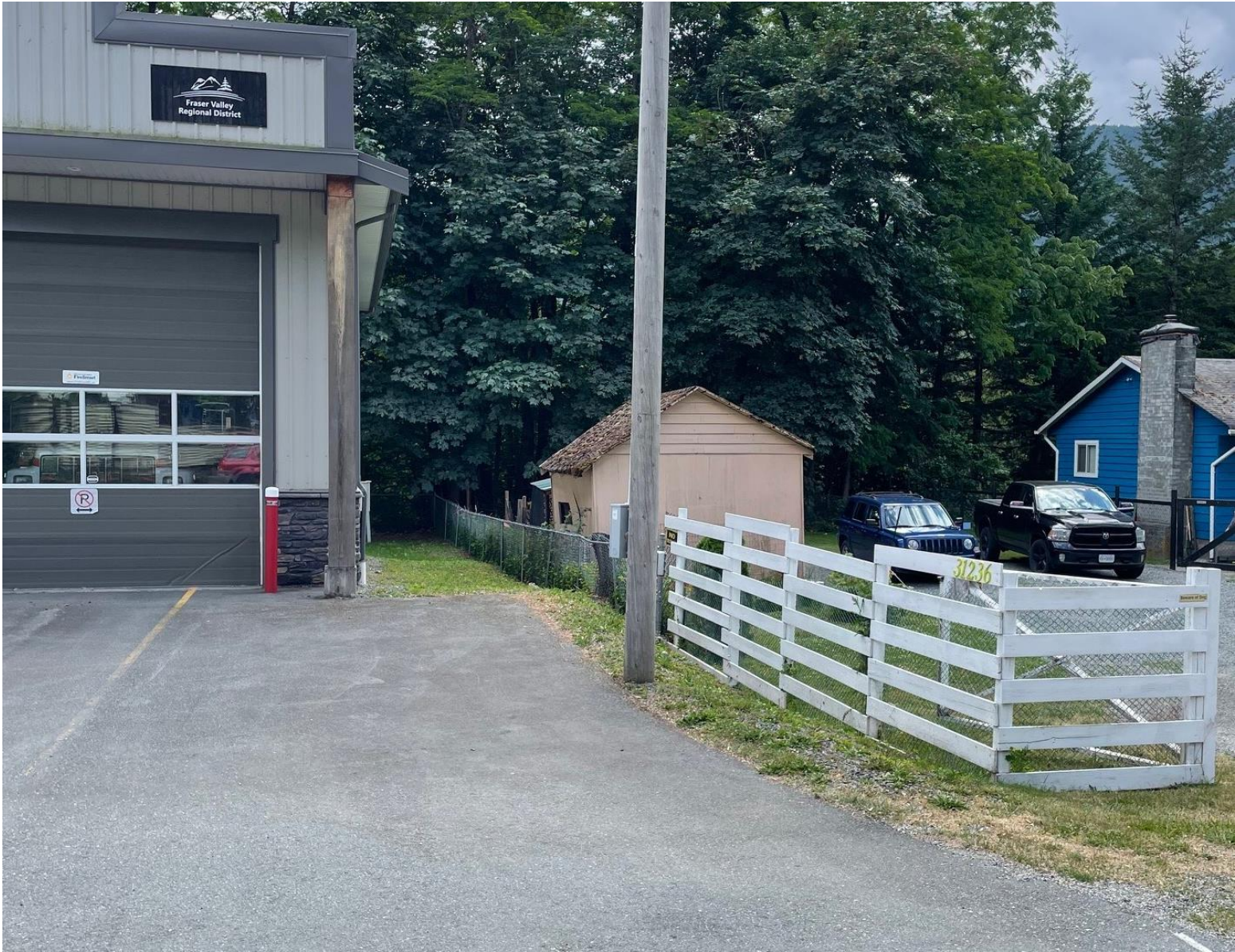
Fig 2. Yale fire hall I west fence