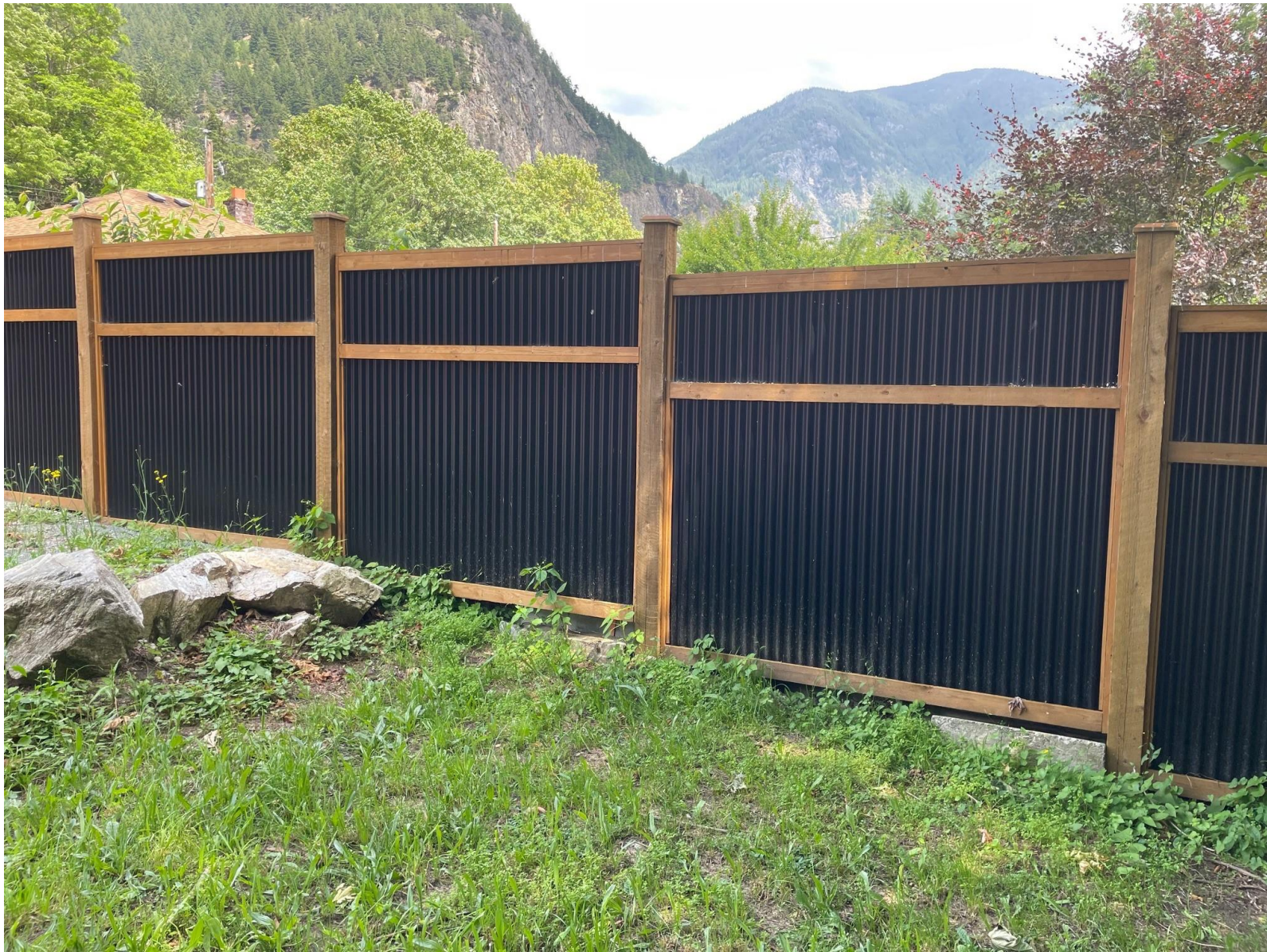
Fig 3. Yale fire hall I east fence