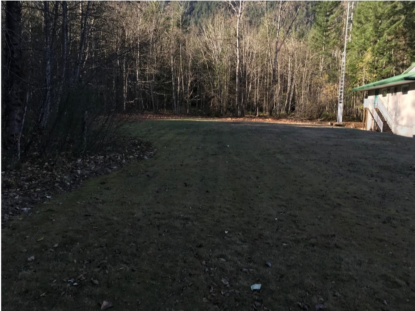
Fig 3. Fenced compound site

* A PDF version of the site plans contained in Schedules A and B is available via email through the FVRD contact named in Section 5.0.